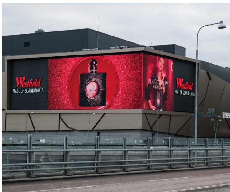
Mall of Scandinavia Outdoor - width: 2048px length: 640px

IMPORTANT NOTE – MOS screen embraces two surfaces but is rendered as one video file. Leftside width: 1344 pixels Rightside width: 704 pixels Guidelines: Please avoid using bright background colors (ex white, grey).