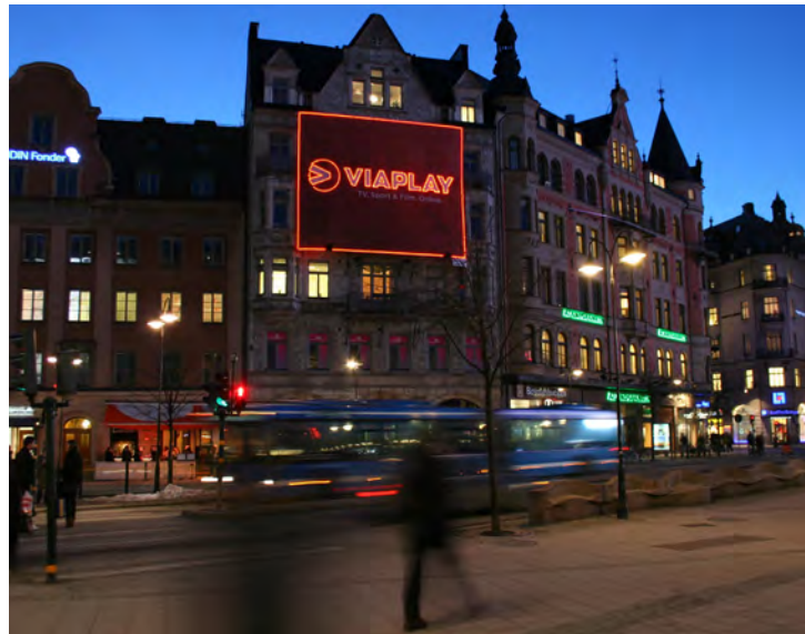
BIG SIZE BANNER WITH LED LIGHT